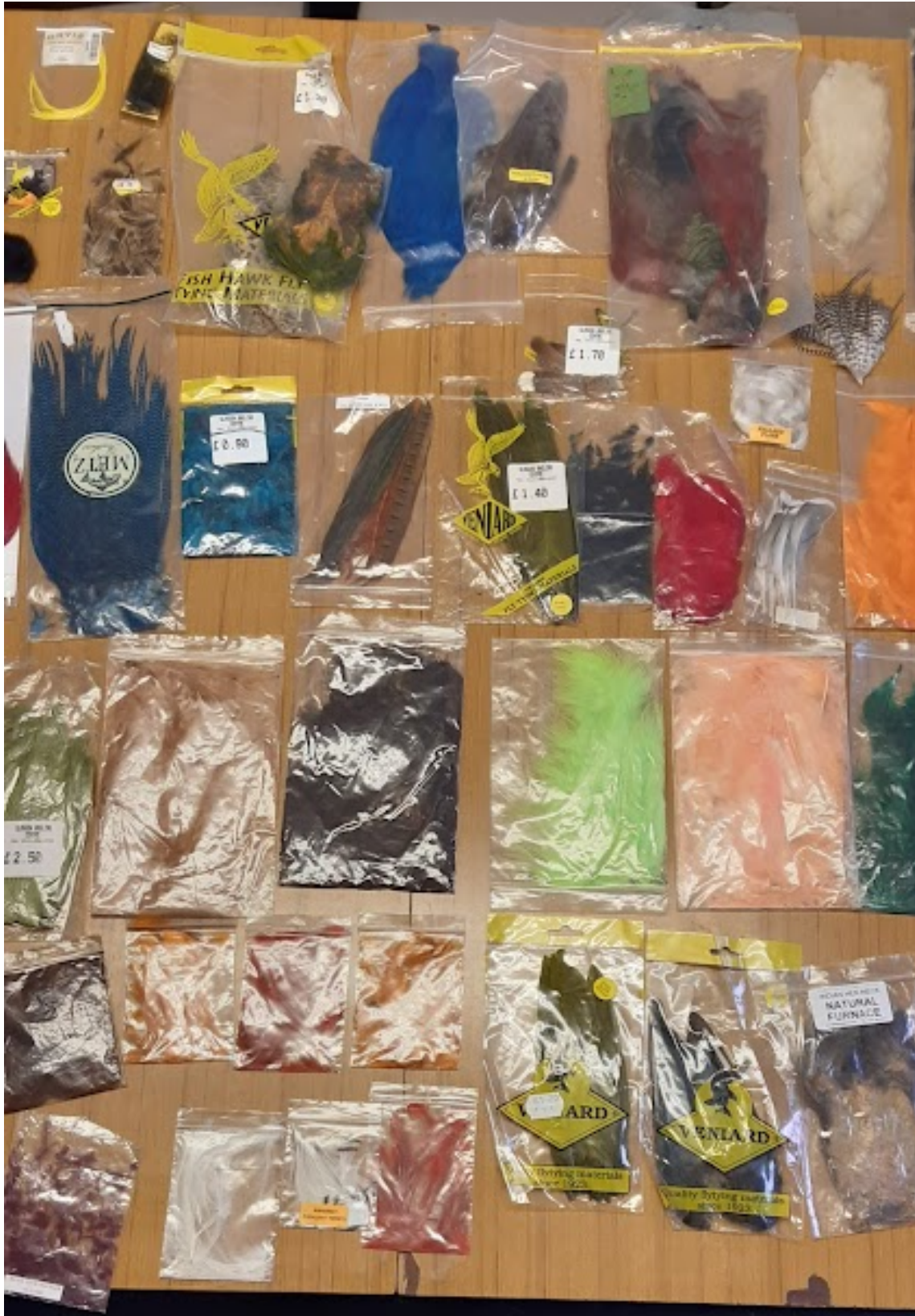
Capes, wings and hackles