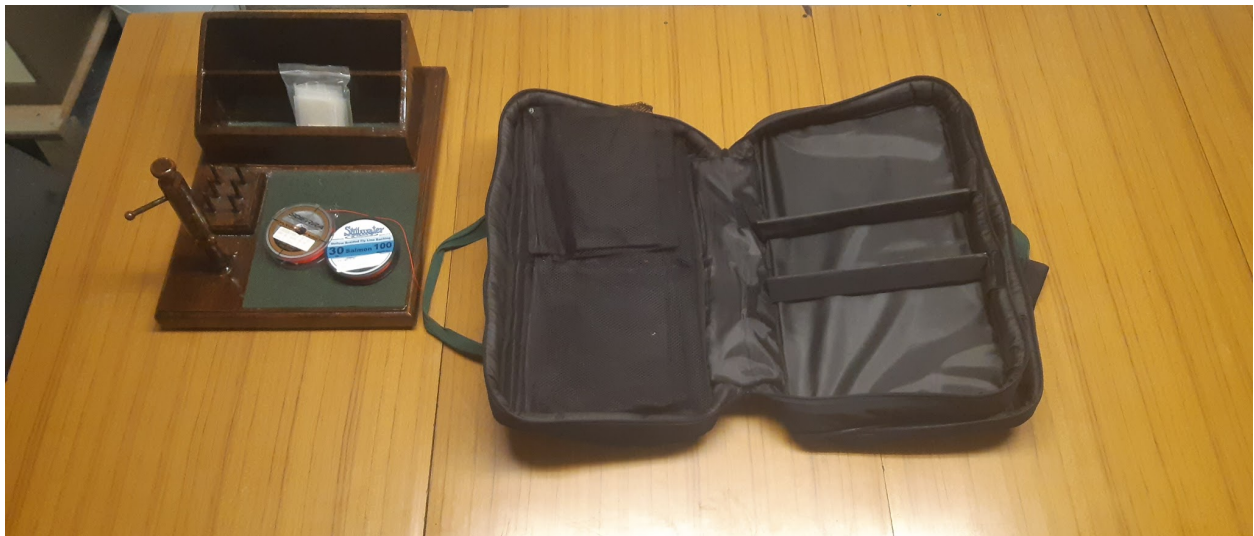
Tool tray with hanger and the holdall - it all goes into this - just about!