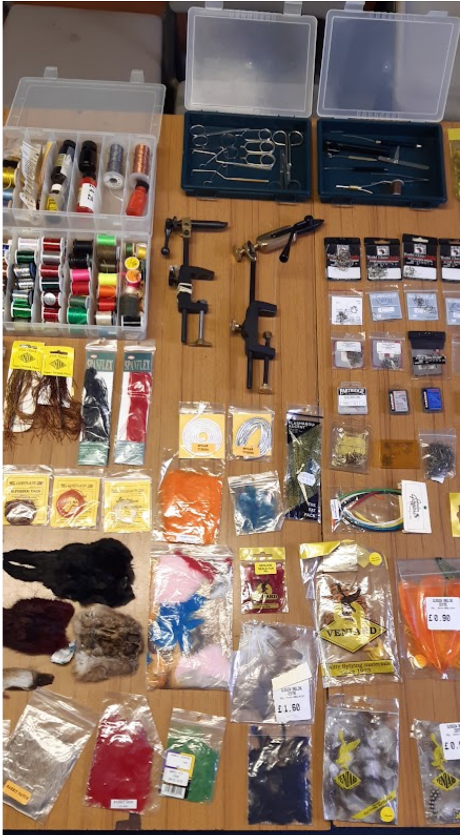
Hackle pliers, scissors, whip finish tools, needles, bobbin holders, silks, hooks, vices, hares masks, larval body wrap, mylar, biots, hackles and more.