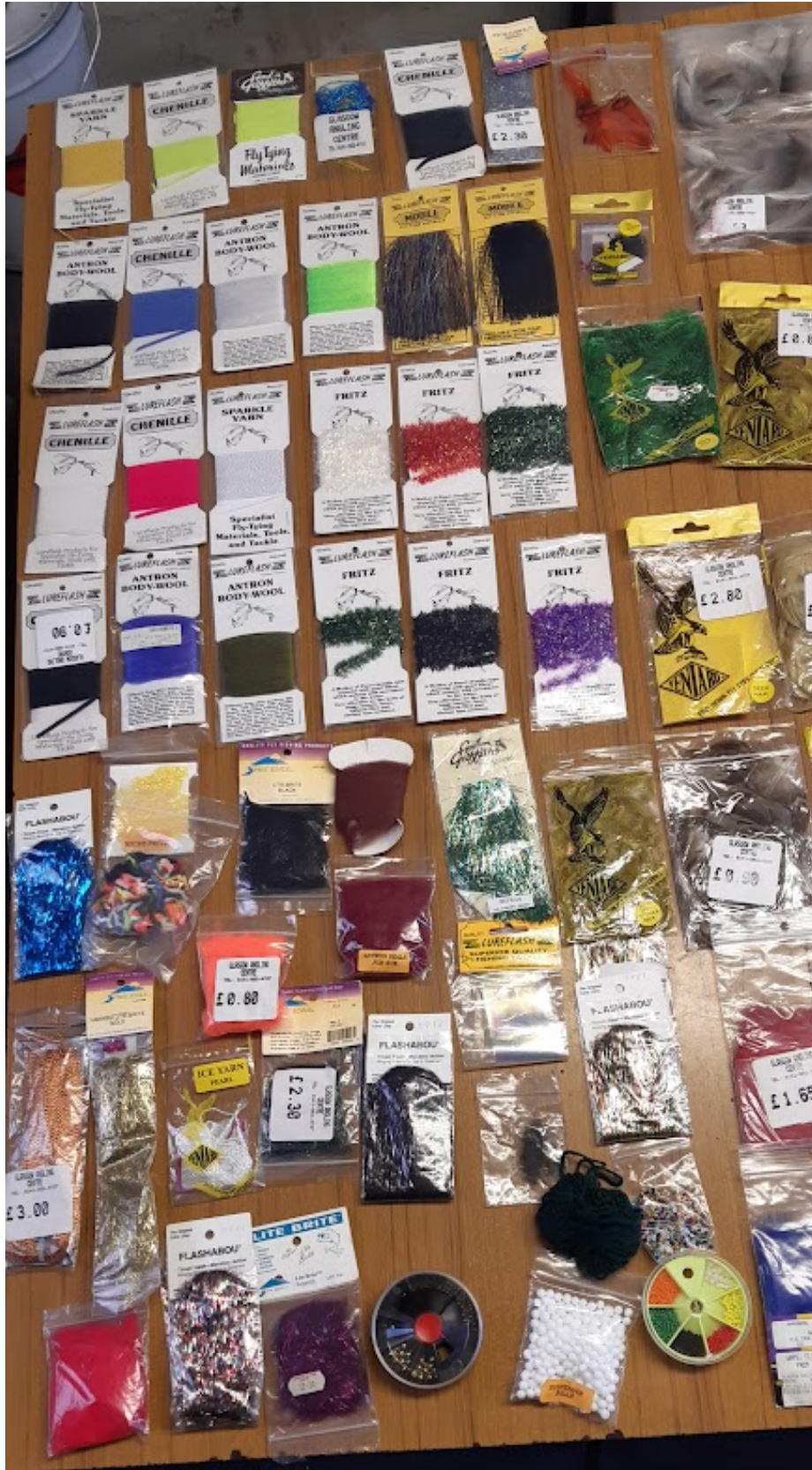
Chenille, Fritz, wool, Flashabou, hackles and beads galore...