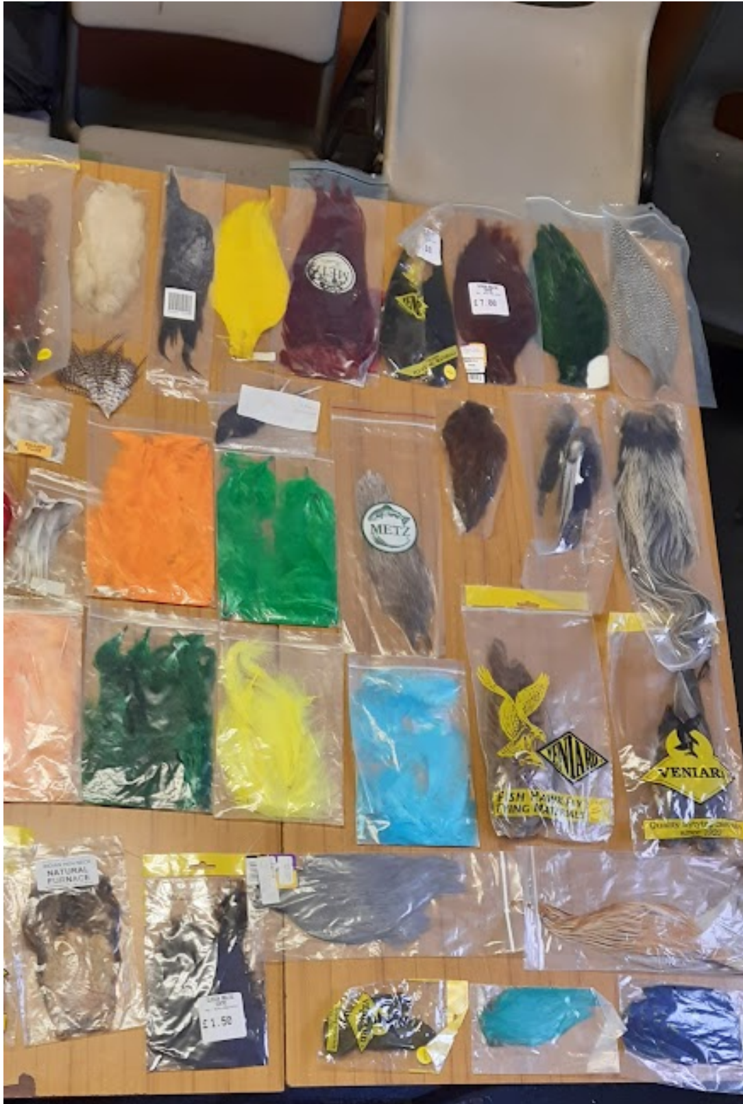
Capes, marabou and hackles.