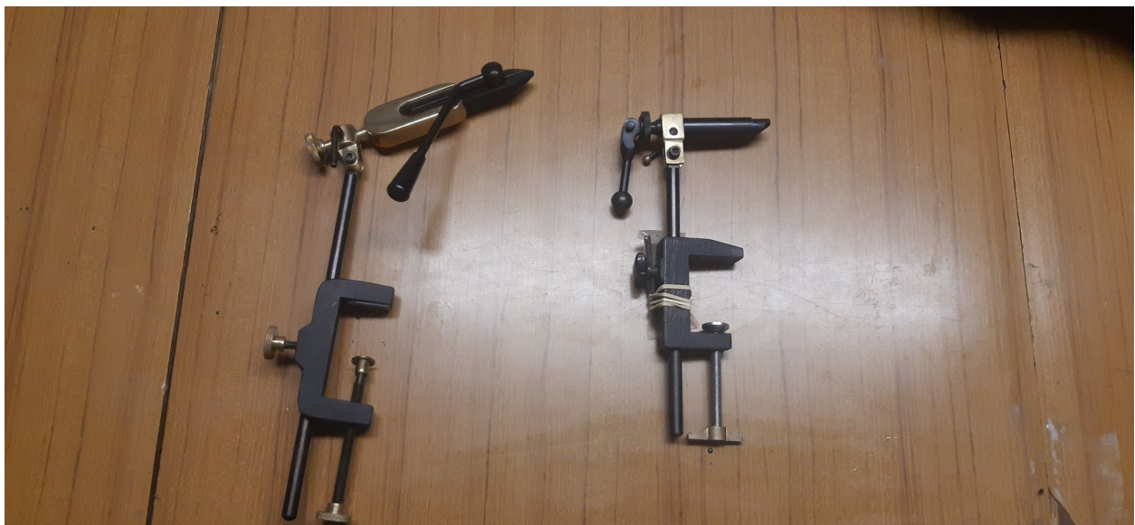
Large and small lever operated vices.