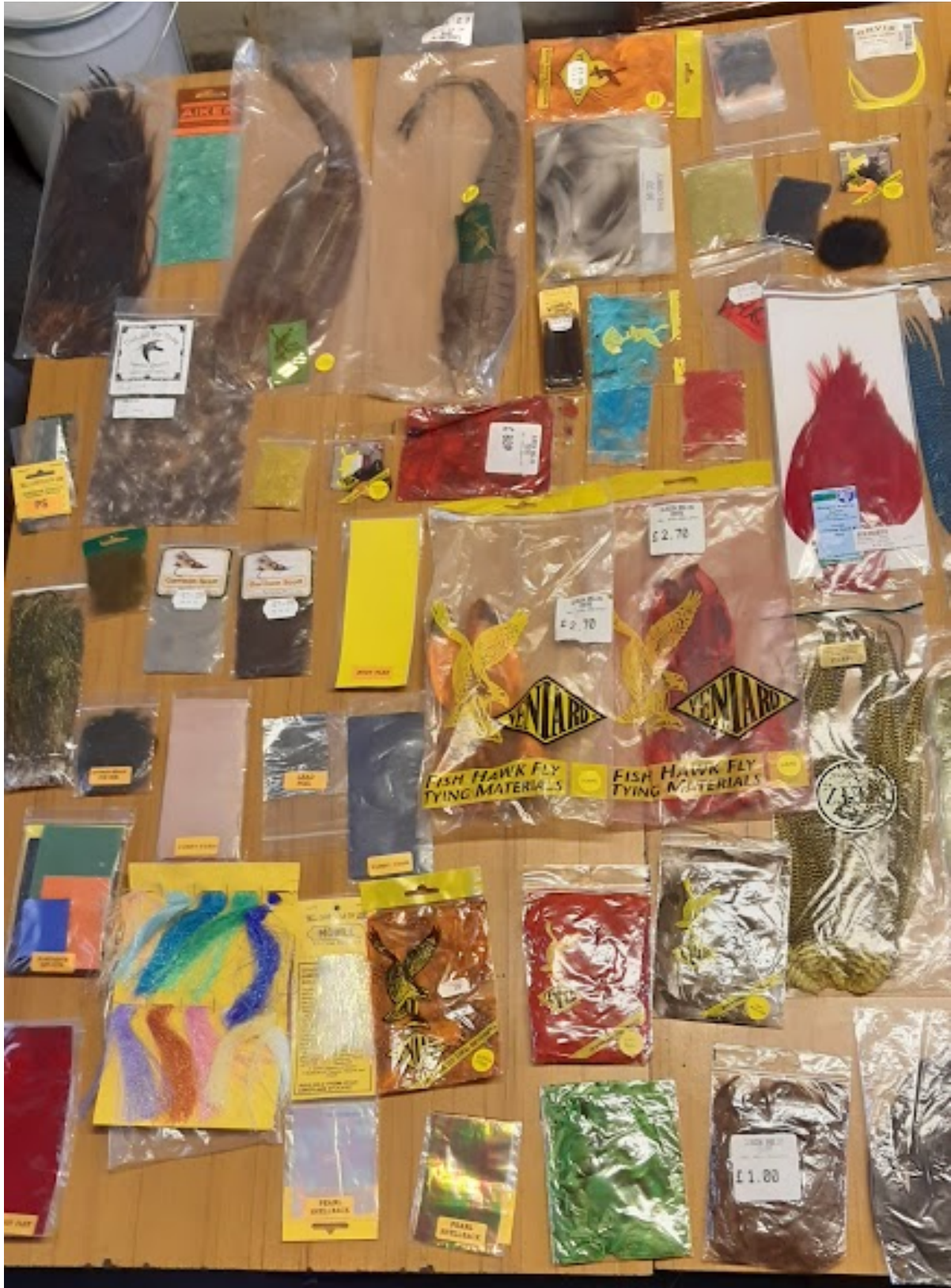
Tails, capes, Flashabou and hackles