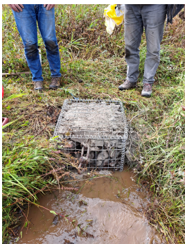
A gabion will provide a strongpoint to moor the boat at Loch Nell